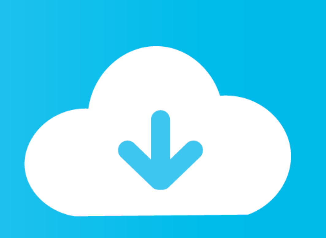
Call Of Duty 3 Highly Compressed Pc Game 148